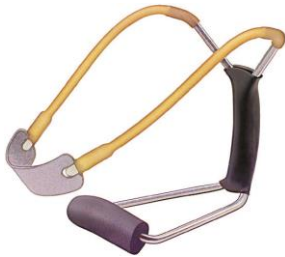
TWS-1 with wrist brace