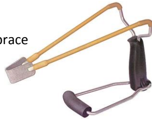
TFS-1 folding slingshot