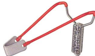
TS-9T tapered band