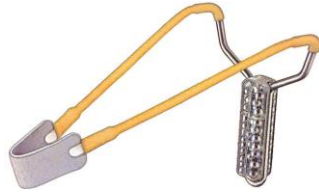
TS-9 ammo in grip