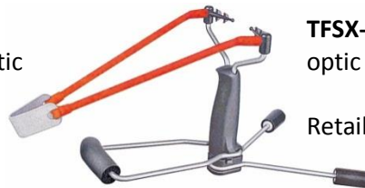
TFSX-2000 Folding, fibre optic & stabiliser