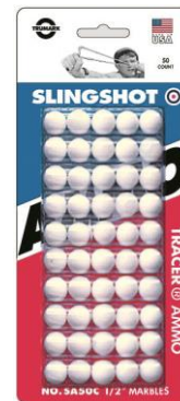
TSA50C Trumark Tracer Ammo – 50 Per card